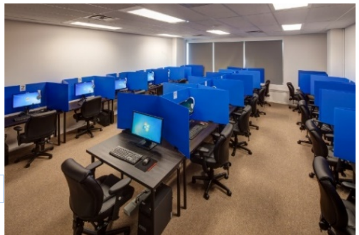
One of IranPoll's Call Centers

IranPoll is a member of ESOMAR, American Association for Public Opinion Research (AAPOR), MRIA, and WAPOR and follows their industry standards.