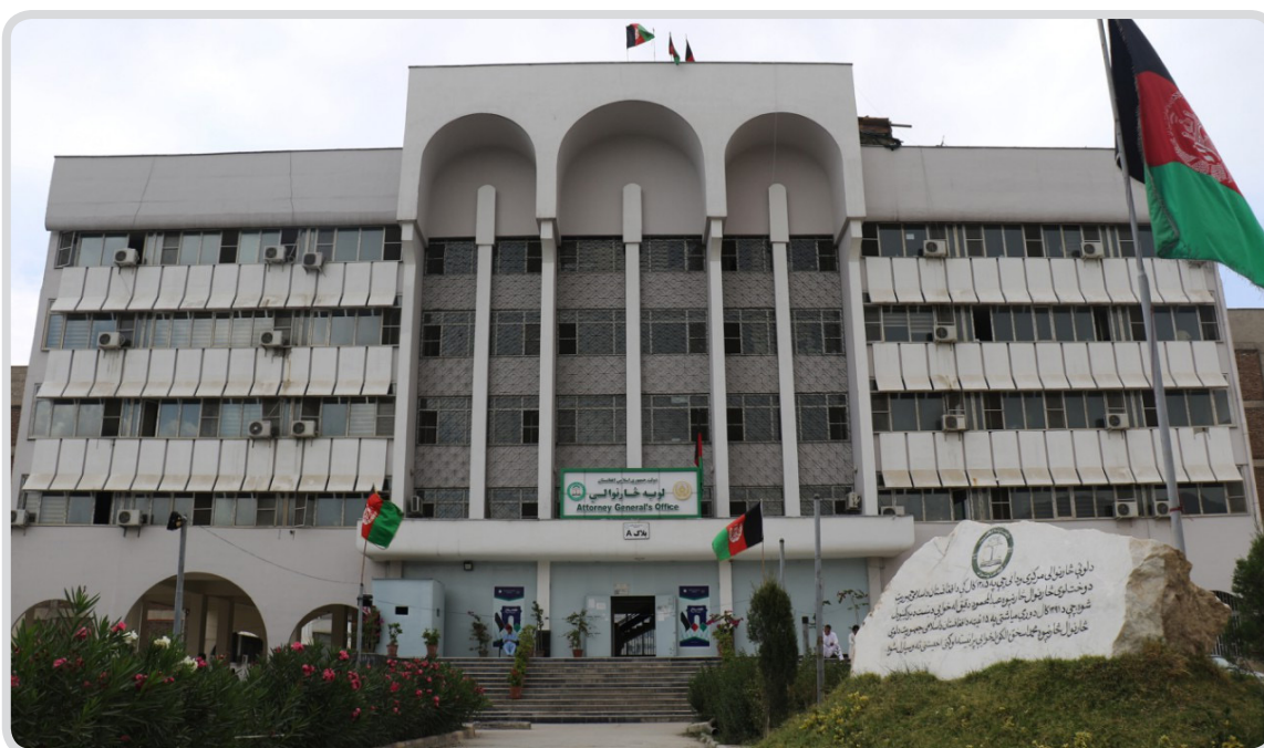
related cases were usually investigated by the AGO and their results shared with the media and the public. (Pajhwok)